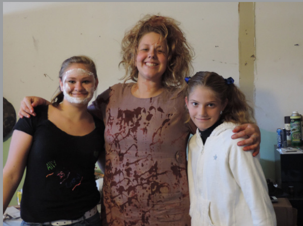
Volunteers getting ready in hair & makeup

Greencastle Haunted Acres is run solely on a volunteer-basis. Volunteers are trained in their performance as well as safety procedures prior to the beginning of each season. Performers may choose to volunteer on a regular basis or for only a few nights. Anyone interested should contact us or stop by Bravo Fireworks for more information.